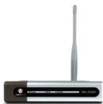
D-Link DWL-2230AP 802.11g Access Point with PoE for DWS-3200 Series Wireless Switches