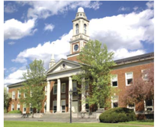
Founded in 1794, Pittsburgh Theological Seminary is a graduate theological institution located in the East Liberty neighborhood of Pittsburgh, Pennsylvania, USA and houses one of the largest theological libraries in the nation.